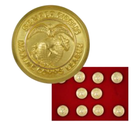
MCL Evening Dress Mess Button Set