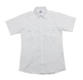
White Short Sleeve Aviator Style