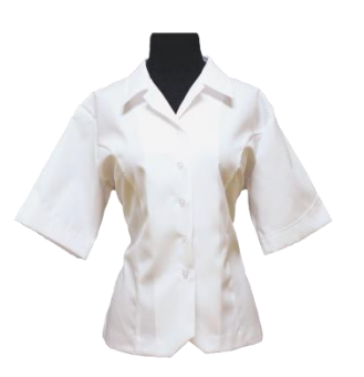
Women's White USMC Style Short Sleeve