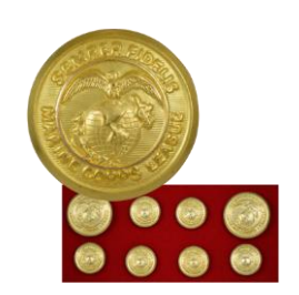
Red Blazer buttons - large & small