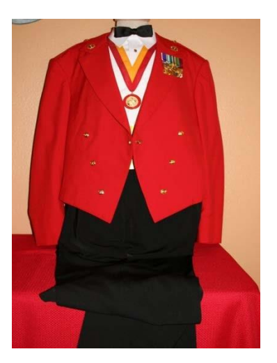
EVENING DRESS JACKET BLACK TUXEDO TROUSERS OR BLACK TROUSERS WITH BLACK LEATHER DRESS BELT