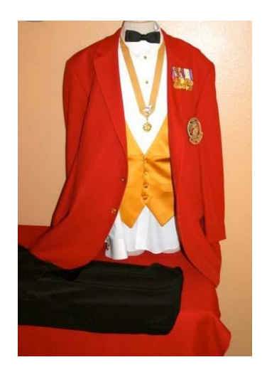
RED BLAZER FORMAL