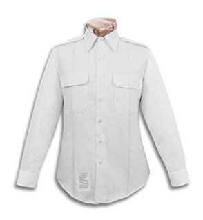
White Long Sleeve Aviator Style