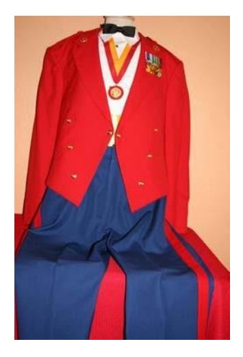
EVENING DRESS JACKET DRESS BLUE TROUSERS WITH RED NCO STRIPE